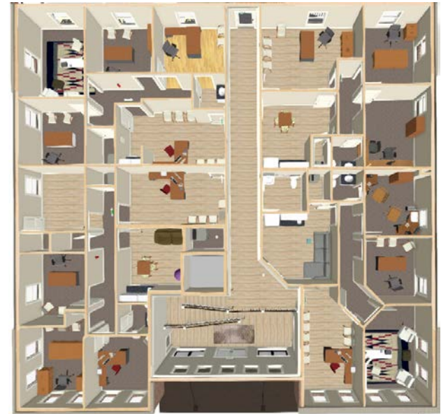
Floor Plan Second Floor